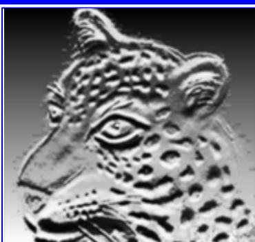
HOME OF THE JAGUARS !